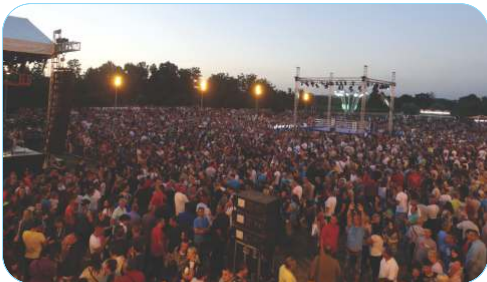
Serbia vs. USA Kickboxing match, town Jagodina, Serbia 2016, 12.000 spectators at open space