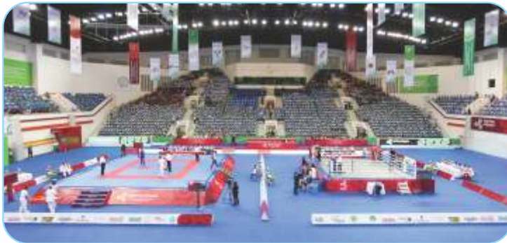
WAKO ASIA Championships 2017