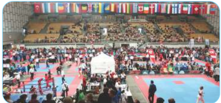
Austrian Classic World Cup 2016