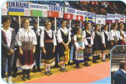
World Championships 2015 Belgrade Opening ceremony