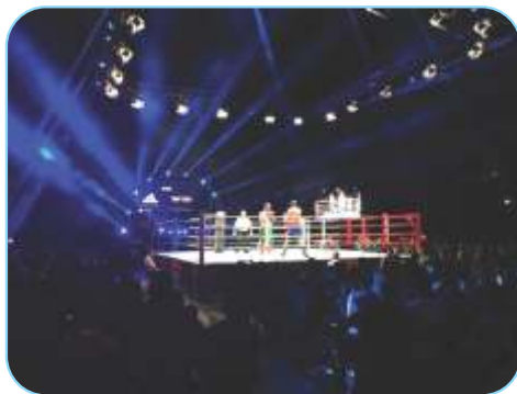
World Championships in Belgrade 2015, 10.000 spectators at Final night