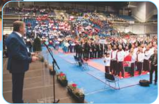
World Championships 2017 Budapest Opening ceremony