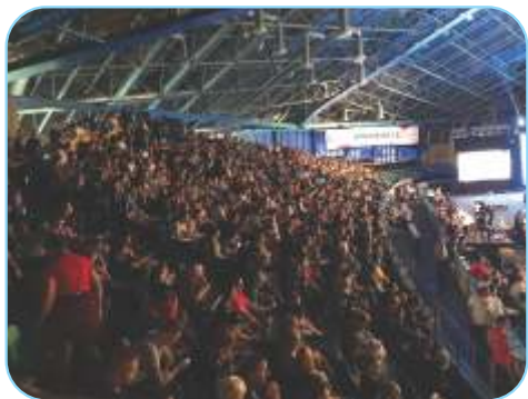
WAKO kickboxing at The World Games final night: Orbita hall full of audience

Our concepts show quality and attract media as well as audience whether it is World Championships, professional fight nights or at finals during World Games 2017.