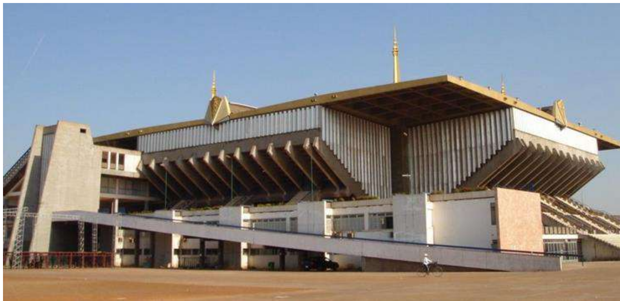
Olympic Stadium (Phnom Penh) Khmer: ហ្គីម្យដ្ឋានជាតិស្វឡាតិក) is a multi purpose stadium in Phnom Penh, Cambodia, located at : Monireth Boulevard, Phnom Penh, Phnom Penh 855, Cambodia